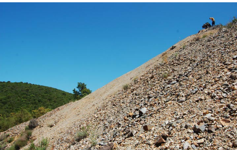
La Caduta (Mimi Coviello [I])

1 0 0 Landschaftsarchitektur Campo dei Giardini / LandWorks 4 / 5