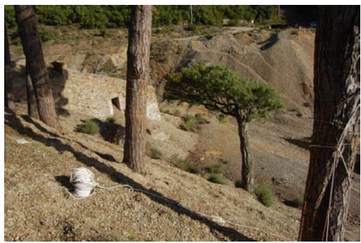
The Window (Panicha Sirinyamas [T])

The Archeological Garden is a rather amorphous staging of part of the mal stream as an excavations site. While meticulously laying open and cleaning a number of infrastructures such as rail tracks, walls, foundations, a small path is the main build structure in this garden. The path enables and implies the possibilities of touring the remainders of the industrial past, which is now slowly reaching a higher complexity of landscape. The small mise-en-scene is in fact suggestive of the narrative potential of the whole dysfunctional, post-mining landscape. (Sara Angelini [I])