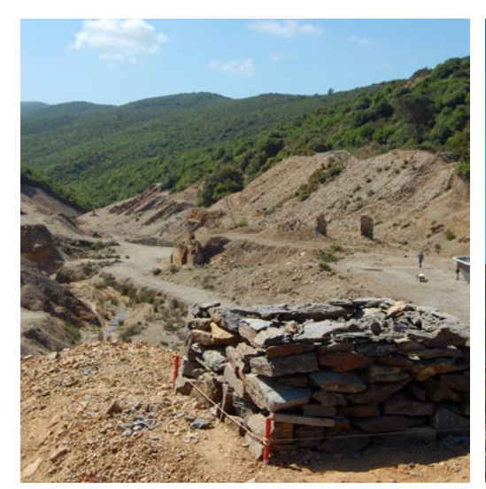
Control Tower (Yasaman Donyagardrad [IR])